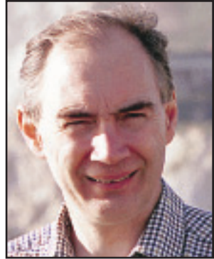
Andrew Turner - seeking re-election as the Island's MP