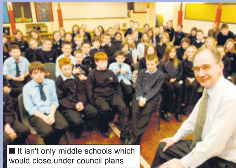
It isn't only middle schools which would close under council plans

Plans to reorganize the Island's schools into a two tier system, estimated to cost £70 million, are causing consternation for parents, teachers and governors. Andrew Turner, who is up for re-election said, 'Closing middle schools and many small village schools would divert everyones attention from the essential business of getting better results.'